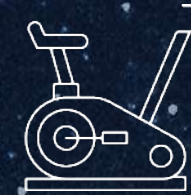
FULLY EQUIPED GYM