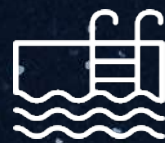
HEATED ROOFTOP INFINITY POOL