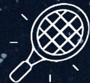
ROOFTOP PADEL COURT